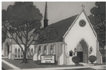
CELEBRATION COMMUNITY CHURCH