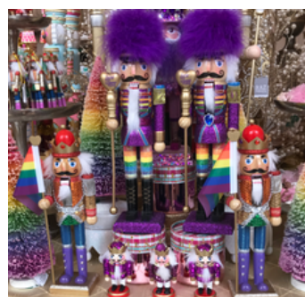
Gay Pride Christmas Nutcrackers by Kurt Adler, Inc. seen in December at Bass Hall in Fort Worth