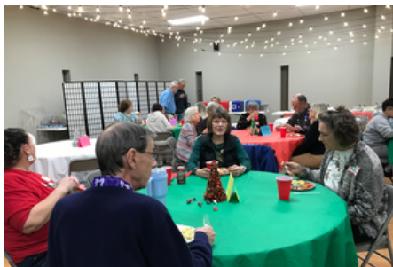
PFLAG Fort Worth December 2025