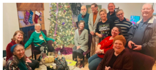
Merry Christmas from PFLAG Fort Worth

The purpose of HIV Cure Research Day is to raise “awareness about HIV cure research” and for “celebrating the efforts of researchers, advocates, and community members working towards finding a cure for HIV.” Read more here.