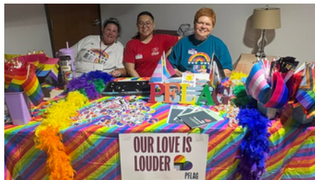
PFLAG Fort Worth at LGBTQ SAVES Picnic

Join your PFLAG friends by bringing a dish and/or coming to help serve supper to residents of Samaritan House every 4th Monday of the month from 5:30 - 6:30 at 929 Hemphill St., Fort Worth 76104. In June, we'll serve supper on Monday, June 22.